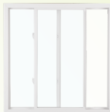
2-lite sliding window