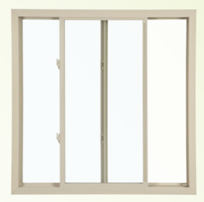
2-lite sliding window