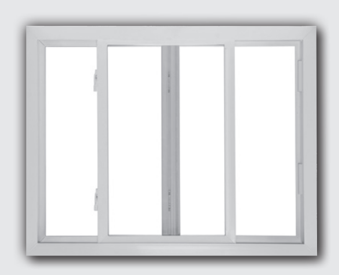
130 2-lite slider with front flange

Min: Max: Width 71 1/2" 108" Height 11 1/2" 63"