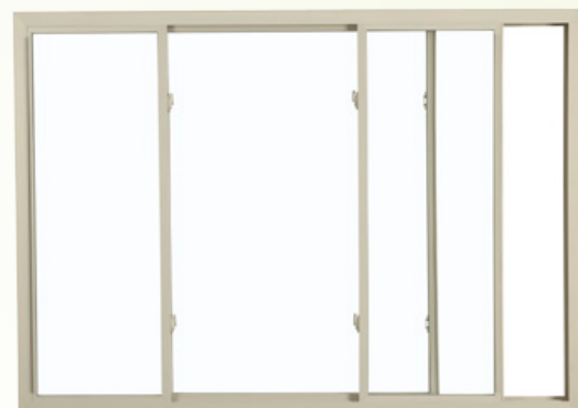
3-lite sliding window