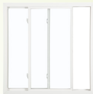
2-lite sliding window