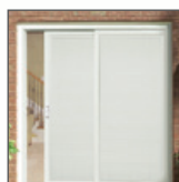
Controls light and privacy