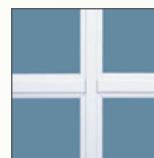
5/8" or 3/4" flat and 5/8" or 1" contoured grids are available